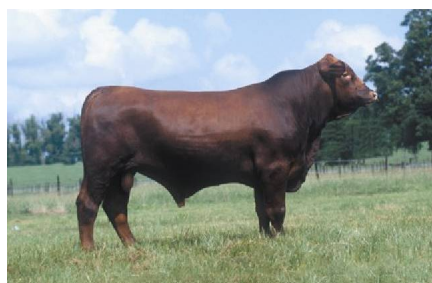
CX RF Dominator 23/K son of CX RF Dominator 23F