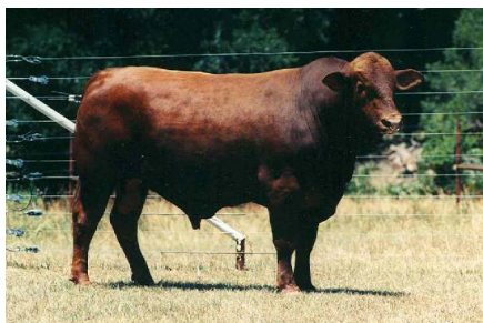
CX RF Deliberate 23F