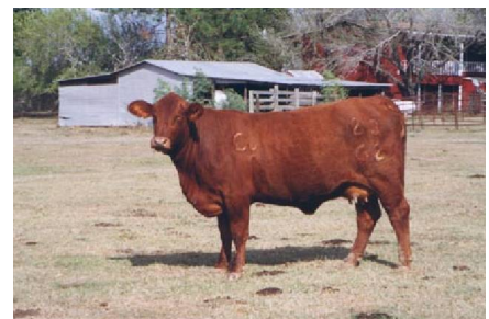
Dam of CX-RF Dominator 23K