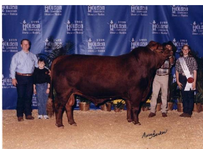
CX-RF Deliberate 23F Sire of CX-RF Dominator 23K