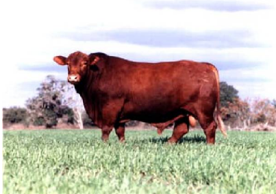
Sensation 872/7 Pasture