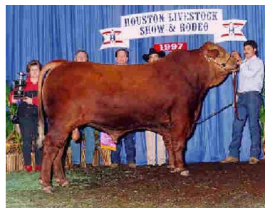
VCC Cardinal 107D