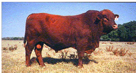
CX Changer 22/7