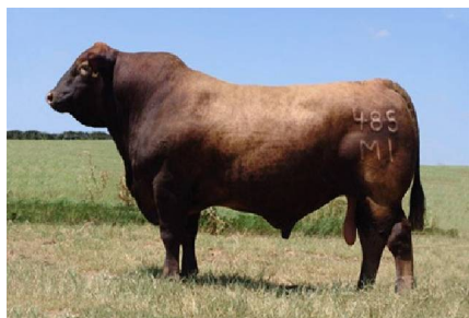
Red Chief 485/M1