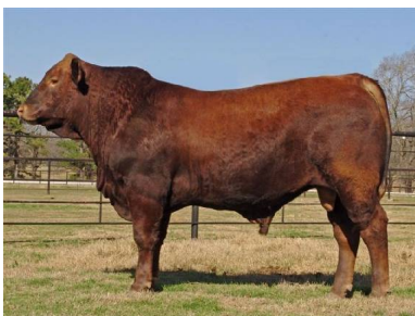
Red Chief 485/M1 (18 months old)